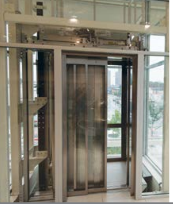
Authorized Savaria dealer: