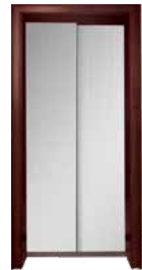
Brushed stainless steel