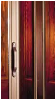
Bronze with smoked acrylic inserts