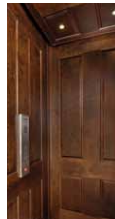
Raised wood panel