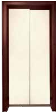
Paintable primer coated

Several finish options are available for both manual and automatic door sills.