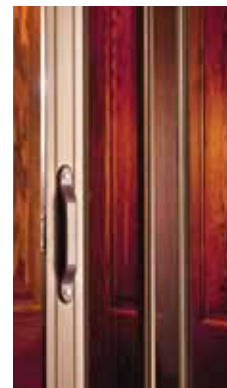
Bronze with smoked acrylic inserts