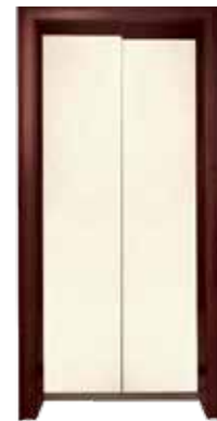
Paintable primer coated

Several finish options are available for both manual and automatic door sills.