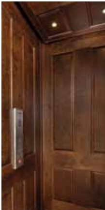
Raised wood panel