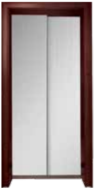
Brushed stainless steel