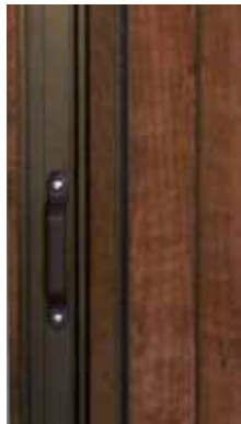
≥ with wood veneer inserts

Also available with vinyl laminate inserts.