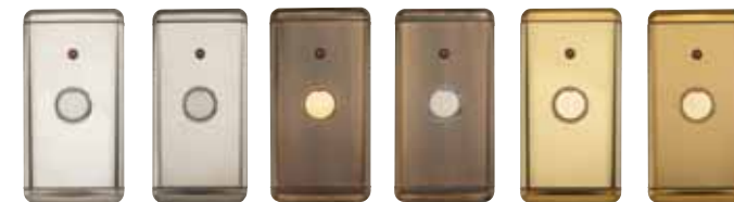
Mirrored stainless with brushed stainless button

Brushed stainless steel is standard, other options are available.